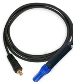
71.24.001 Stick electrode holder