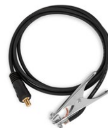
71.25.001 Work cable